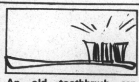
An old toothbrush can loosen sticky dirt on the kitchen can opener.