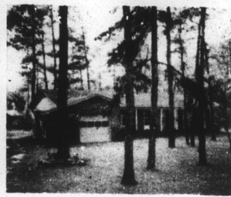
(In Rocky Hook)

This beautiful house, set among the pines, is ready for immediate occupancy. Seven rooms, two baths, fireplace, living room and dining room drapes and all curtain rods included, kitchen range included, in individual room thermostats on electric baseboard heat, carpeted. Lot size 190' x 230' ... 15' x 24' garage. Portion of loan still assumable at 7 1/2 per cent.