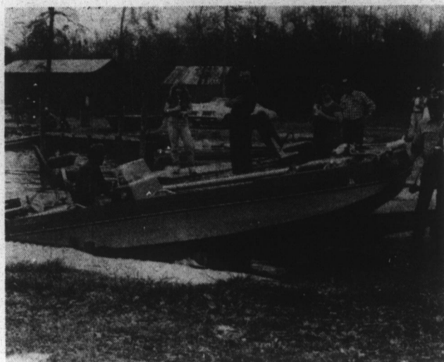
"We're off to catch the biggest and best bass of all!"