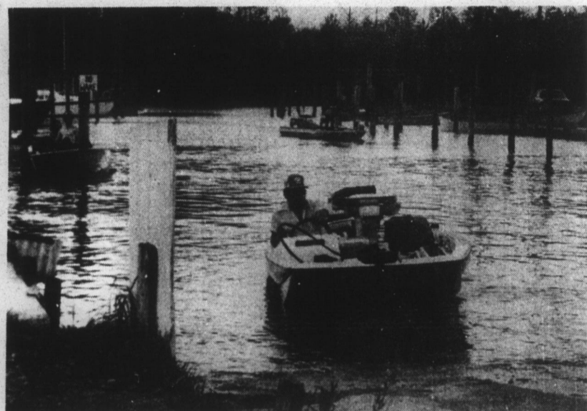
"Well, I tried, but it's time to see who won all that prize money!"