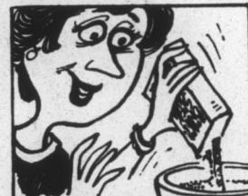
Brown sugar won't harden if you store it in the freezer.