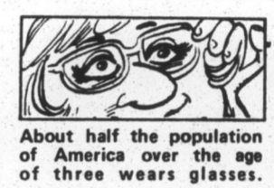
About half the population of America over the age of three wears glasses.