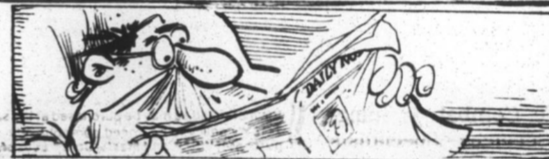
Approximately 69 percent of Americans read a newspaper at least once a day.

Priscilla and Aquila were a married couple that helped Paul in his missionary journey's. They were religious, opened their home to strangers, traveled and worked together in their industry.