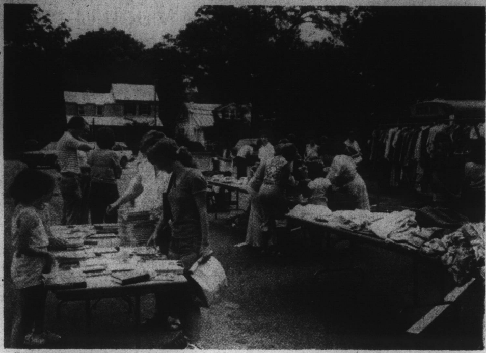
PARKING LOT SALE — The youth of the Edenton Baptist Church held a Parking Lot Sale on June 5 to make money for their upcoming mission trip to Myrtle Beach, S.C. The sale