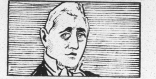
Our only bachelor President was James Buchanan.