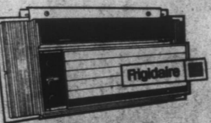
Room Air Conditioners