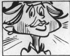
Human beings are the only animals that can blush.

Immediately following the ceremony, a reception was held in the Rosemond Room of the church. The couple will make their home in Chesapeake, Va.