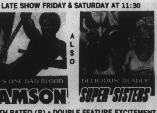
BOTH RATED (R) • DOUBLE FEATURE EXCITEMENT

*********** PHONE 482-2312 OR 793-2185 FOR COMPLETE MOVIE INFO