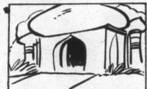
India's Taj Mahal, one of the world's most beautiful buildings, took 20 years to build.