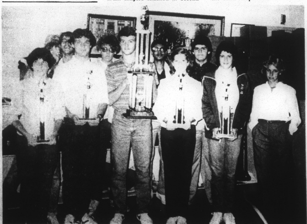
MARCHING ACES RECEIVE FIRST PLACE HONORS - The John A. Holmes High School Marching Aces recently competed in the 10th Annual Virginia Commonwealth University - State Fair of Virginia Marching Band Competition and came away with first place in overall competition, drum line, flag line and rifle line. They placed second in drum majors competition. Don't miss the Marching Aces this Saturday when they host Edenton's Seventh Annual Peanut Festival.

"The Scout Hut" stood quiet on its fifty - third anniversary. It is, Continued On Page 4