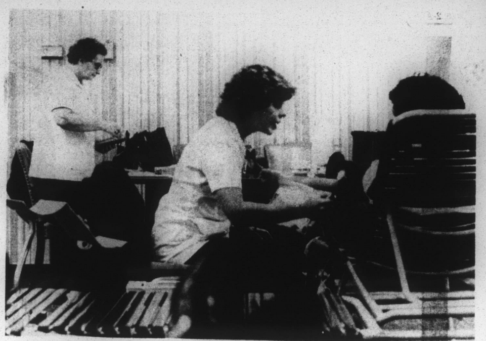
BLOOD MOBILE EXCEEDS QUOTA — The Blood Mobile's visit last week was a successful one. There were 192 donors that came to give blood and 173 units of blood were collected. The quota was 150 units.

No invitations are being sent. Friends and relatives are invited to attend.