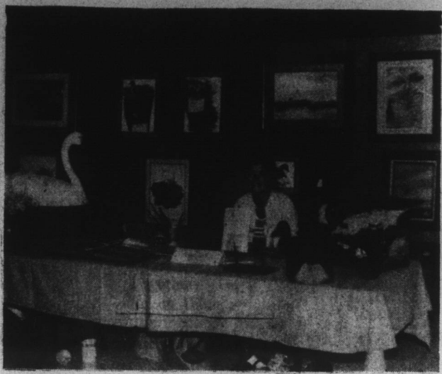
WILDFOWL PAINTING SHOWN — "Laney" Layton exhibited her paintings in watercolor at the Atlantic Wildfowl Festival at the Virginia Beach Pavilion.