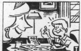
Hobbies can help your children grow.

Should you encourage your child to develop hobbies? Experts on child-rearing say too often parents leave this fascinating facet of life up to their offspring, who may miss the opportunity altogether, perhaps even affecting their ability to grow intellectually and socially.