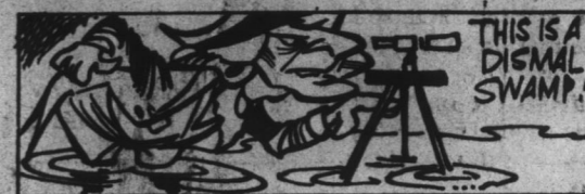
The Intracoastal Waterway of North Carolina had its beginning with a survey of the Great Dismal Swamp by George Washington in 1783.