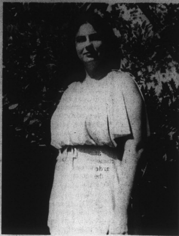
Kathy Lynn Griffin