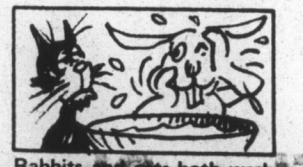
Rabbits and cats both wash their faces with their paws, but a rabbit uses both paws at once and the cat only uses one paw at a time.