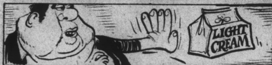
Light cream contains 18 to 30 percent butterfat.

A large crowd of Jehovah's Witnesses and friends assembled Saturday and Sunday at the Martin County Auditorium in Williamston for the semi-annual Circuit Convention of Jehovah's