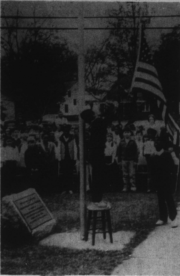
SHARING COURTESY AND RESPECT —Third grade classes at D.F. Walker participated in a flag raising ceremony Friday morning to share with their guest their love for this country.