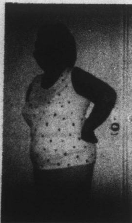
Before: 197 1/2 lbs.