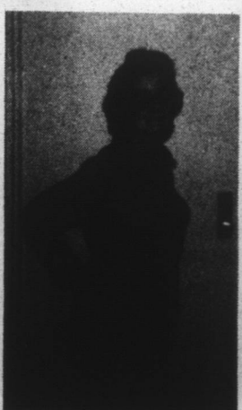
After: 147 1/2 lbs.

Thank goodness for Professional Weight Loss Clinic. At age 59, and weighing 197 1/2 lbs. I felt as if I were 80 years old. Now after taking off 50 lbs. I feel years younger. I've learned self discipline, self confidence and the real joy of living without overeating.