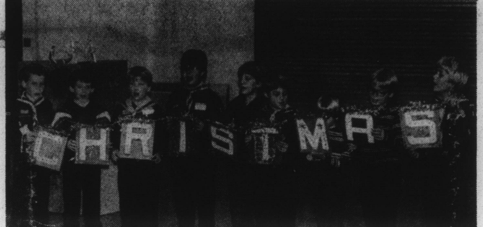
SCOUTS WISH COUNTY MERRY CHRISTMAS-Den 1 of Cub Pack 164 spell out the word Christmas during the closing ceremony of the Scout Christmas Dinner.