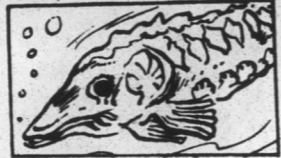
Sturgeon can live up to three hundred years.

"There is an increasing emphasis on energy conservation programs as costs rise," says Cooper. "For more information, most utility companies today can offer individualized, professional advice on how to keep your energy bills low."