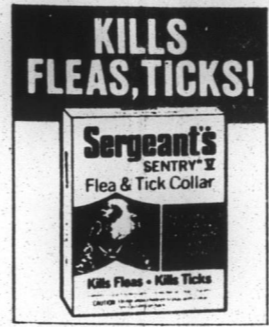
KILLS FLEAS, TICKS!

A Church Conference has been called for Sunday following the Worship Service to consider a recommendation from our Board of Deacons concerning purchase of property. Plan to be present and let your voice be heard.