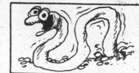
The earthworm is often known by several other names, including fishworm, angletworm or night crawler.