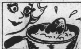
To accelerate the baking of a potato, first boil it for about ten minutes.