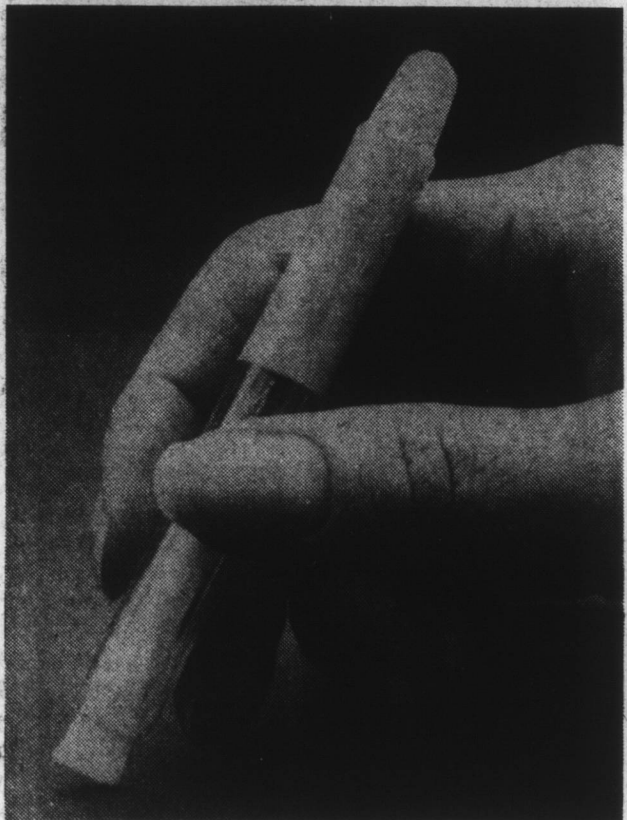
The Super Brush

The Magellanic penguin of the South Atlantic spends five months of the year at sea, never once touching land.