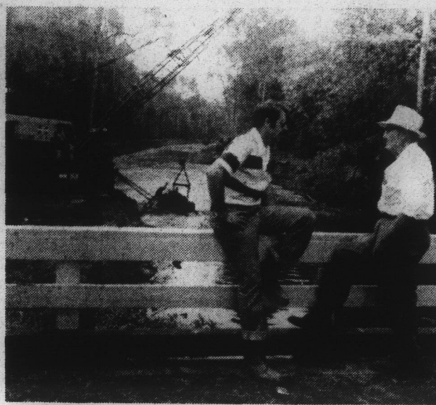
INSPECTING DRAINAGE PROJECTS —Contractor and local drainage commissioner inspect work on the Bear Swamp main channel during the early construction stages of the project. First planning, and then installing the projects, now the maintaining of the projects.

Since 1973, the advertising department of Belk Tyler has accumulated 38 top awards from various competitions.