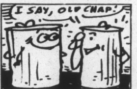
Our "trash can" is known in England as a "dust bin."