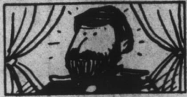
U.S. Grant's real name was Hiram Ulysses Grant.

The UMYF/EYC will meet at the church at 6 P.M. for supper and program.