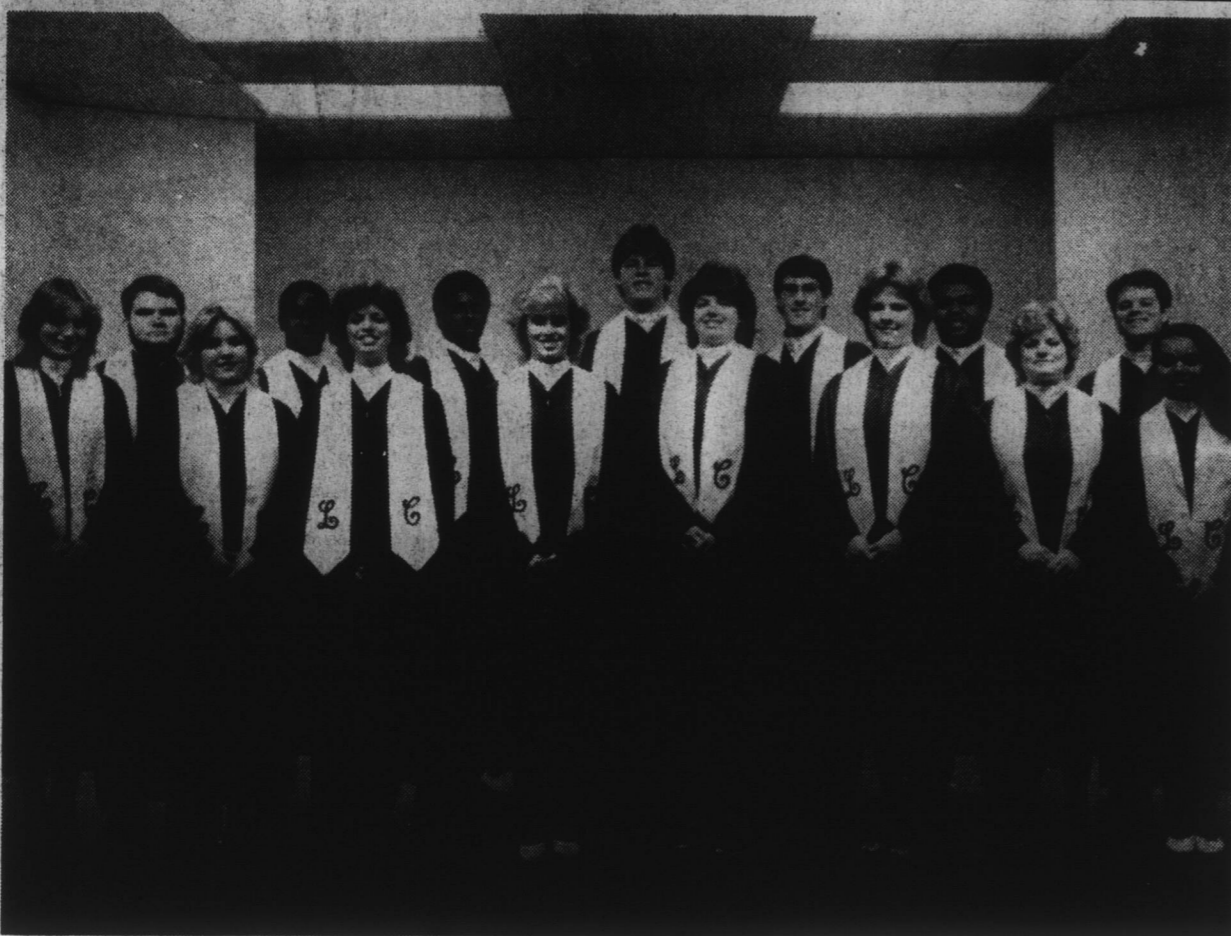
The Louisburg College Ensemble