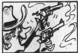
Sharpshooter Annie Oakley's real name was Phoebe Mozeze.