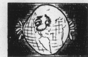
The world is not round. It is an oblate spheroid, flattened at the poles and bulging at the equator.

DECA members visited Military Circle in Norfolk, Virginia on May 25. The members, who were conducted on a tour of the mall, were studying various window displays in the mall. Window displays help to sell the goods in a particular store which is very important to DECA students who study marketing and distribution.