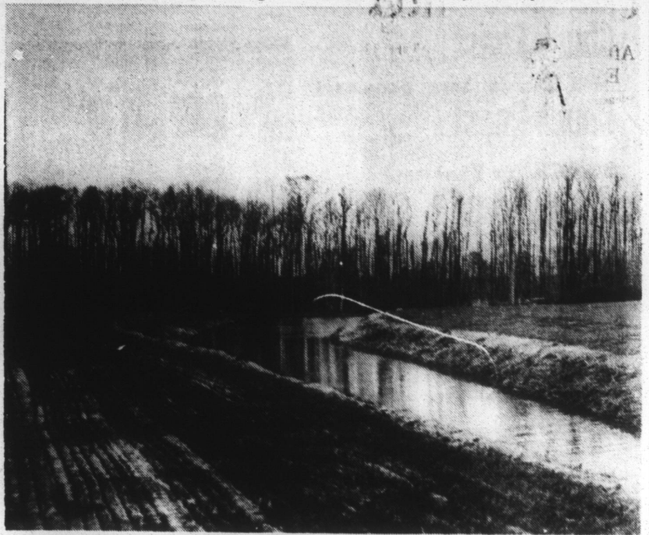
FARM PONDS—Farm ponds provide hours of enjoyment to North Carolinians. Uses include irrigation and water for stock but mainly they are used for recreational fishing.

Ponds should be a source of enjoyment to their owners and by proper management they can be just that.