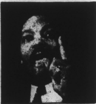
Rev. Jesse Jackson considers presidential bid