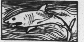
The white shark is the only creature in the sea with no natural enemies. Even killer whales avoid it.

the crackling fire of the close range anti-aircraft guns. Admission to the outdoor drama is $1.50 for adults, 75 cents for children 6 through 11, and free for those 5 and under.