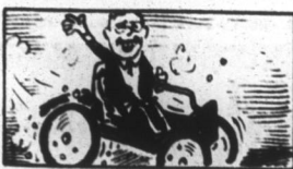
Theodore Roosevelt was the first U.S. President to ride in an automobile.

The 1983 North Carolina Annual Conference will be held at Methodist College, Fayetteville, N.C. June 5-9.