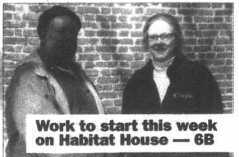
Work to start this week on Habitat House — 6B