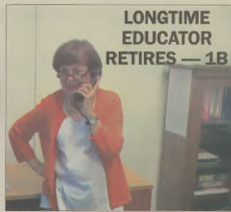
LONGTIME EDUCATOR RETIRES — 1B