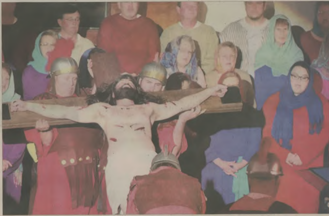
More than 1,200 people attended performances of "His Love Ran Red" during Easter weekend at Rocky Hock Baptist Church.