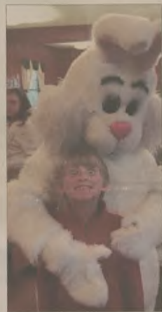
Easter Bunny met with many kids on Sunday to celebrate the holiday, perhaps with chocolate rabbits.

Holy Week offered an opportunity for praise and worship throughout Chowan County.