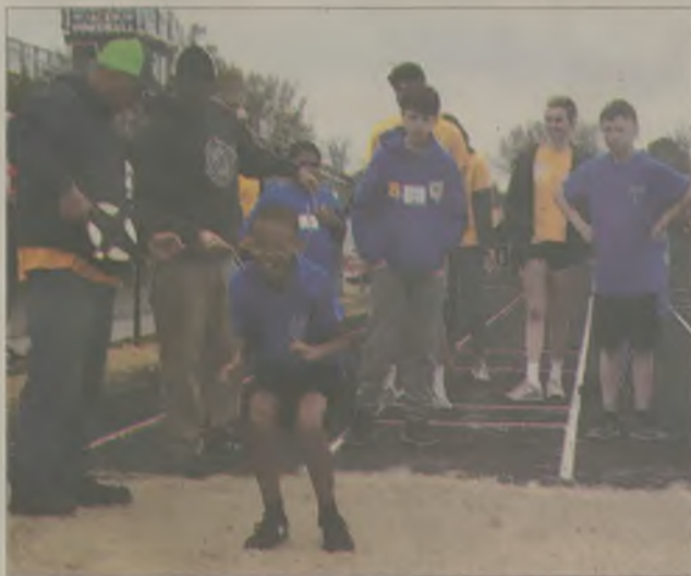
A boy smiles after completing one of his long jump attempts Friday.