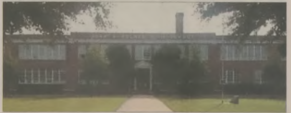
John A. Holmes High School