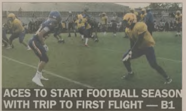
ACES TO START FOOTBALL SEASON WITH TRIP TO FIRST FLIGHT — B1

Training exercise: The Chowan County Sheriff's Office will conduct a training exercise this morning, Aug. 21, in conjunction with Edenton-Chowan Public Schools, local emergency services and state agencies. The exercise will be held at D.F. Walker Elementary School and is closed to the public. Any emergency services activity in the Sandy Ridge Road area will be due to this pre-planned training exercise.