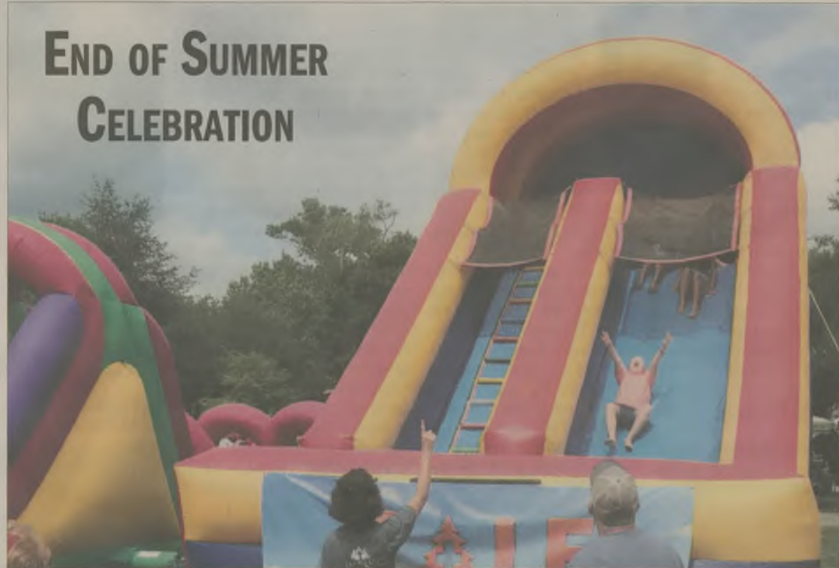
A girl waves her hands in the air as she triumphantly makes her way down a Camp Cale inflatable slide Saturday during Edenton United's Back to School Bash at John A. Holmes High School.