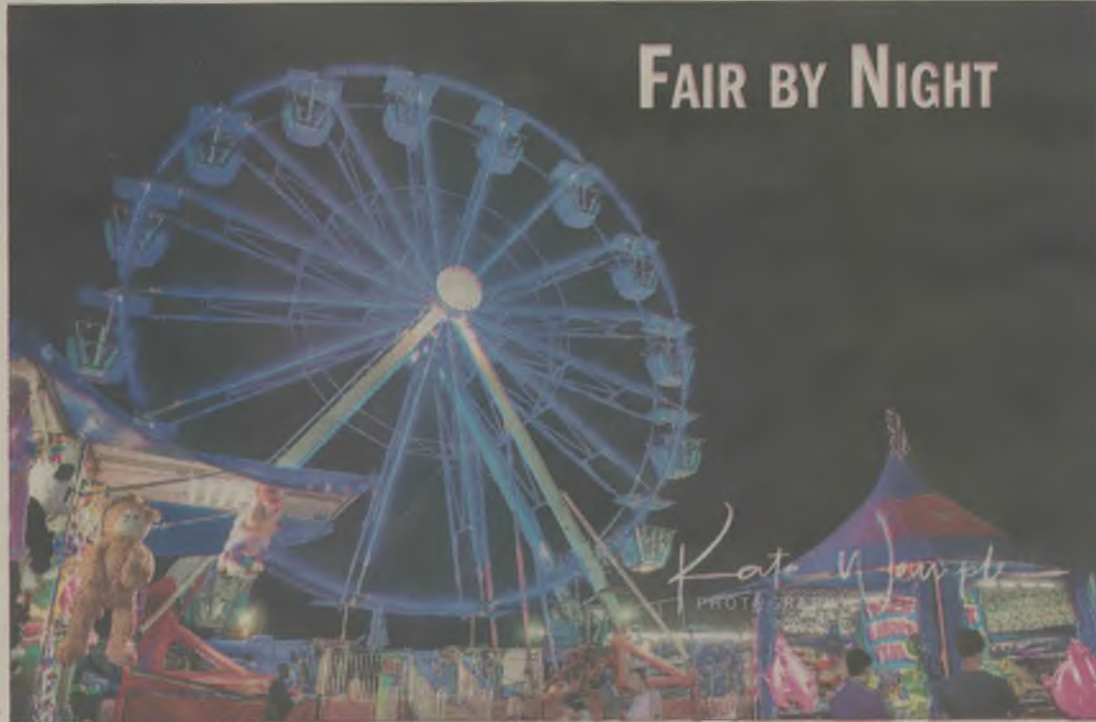
FAIR BY NIGHT