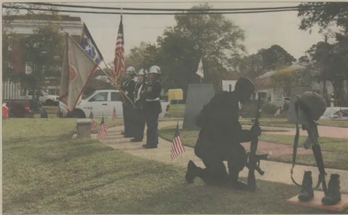
The John A. Holmes High School Junior ROTC presents the colors Monday during the Veterans Day ceremony hosted by American Legion Post 40.