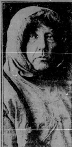
CAP. ROALD AMUNDSEN, who left Nome, Alaska, on April 12th by dog team for Wainwright on the Arctic Ocean, 500 miles north of the point he left. From Wainwright, Captain Amundsen will attempt to fly over the North Pole to Norway in June.