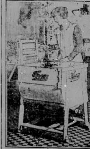
Washing Clothes the Electrical Way lamp chimneys or going down cellar with a candle. Instead a switch is turned as quickly as the wink of an eyelash and instantly all the light one can wish for fills the room.

And in such farm houses no one is seen filling kerosene lamps or washing