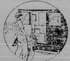
Big loading space by removing rear seat and upholstery.