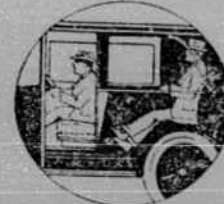
Both seats adjust forward and back for tall and short people.