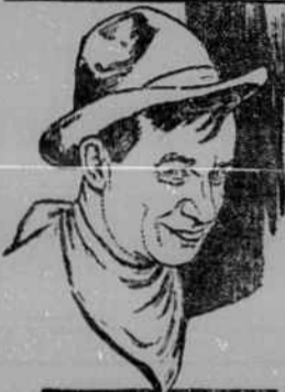
Another 'Bull' Durham advertisement by Will Rogers, Zigfield Folles and screen star, and leading American humorist. More coming. Watch for them.