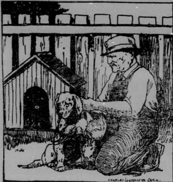
He Around His Neck the Next Chicken He Kills and Leave It Hanging There for Three or Four Days.

THE air was fresh from a furious little thunderstorm which had swept Vine street. Old Man Negley climbed the steps of the Veller porch, where sundry of the street's dog-owners were waiting to get his advice on their canine pets' hot weather condition.