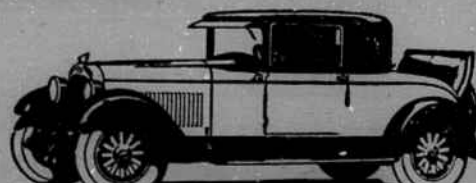
The Sport Cabriolet $835

Dash, rakishness and sheer value in a four-passenger open car have never been so supremely combined as in the new Pontiac Six Roadster at $775. Lucerne Blue Duco, striped in Faerie Red. Long, low, graceful lines. Gray shark grain leather upholstery. A swanky rear deck with a spacious rumble seat, a removable top of smart gray material—and, of course, all the power, speed and stamina of the famous Pontiac Six motor!