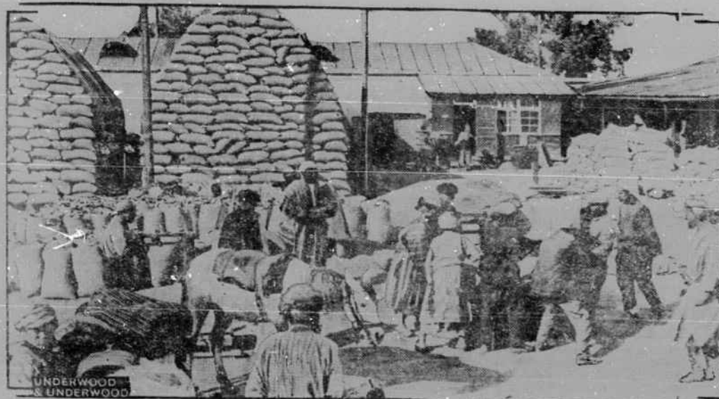
Giving an idea of how Russia is engaged in gathering all the wheat raised throughout the vast domain in order to dump it on the world's markets at a low price, this photograph of one of the stations in Asiatic Russia shows peasants bringing in their grain.