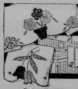
Pattern No. 5348

Let us do a bit of "garden-ing." It's linens we're going to beautify, with cotton patch flowers and flowerpots. This easy applique is sure to enhance a pair of pillow cases, scarf or dainty hand towels. Take colorful scraps, cut them into these simple flower forms, and either turn the edges under and sew them