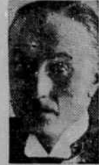
Sir Samuel Hoare