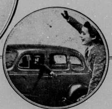
PERFECTED HYDRAULIC BRAKES (With Double-Articulated Brake Shoe Linkage) Recognized everywhere as the safest, smoothest, most dependable brakes ever built.