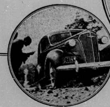
NEW HIGH-COMPRESSION VALVE-IN-HEAD ENGINE Much more powerful, much more spirited, and the thrift king of its price class.

For the first time, the very newest things in motor car beauty, comfort, safety and performance come to you with the additional advantage of being thoroughly proved, thoroughly reliable.